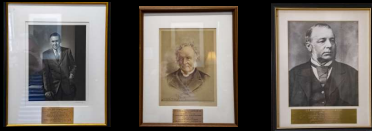
Prominent former Cobourg residents