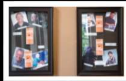
Advertising for Concert Hall events