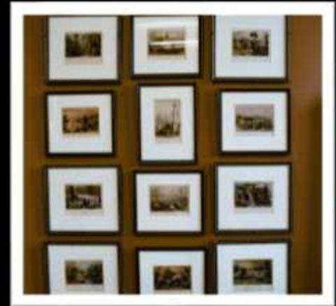
Vintage landscape scenes